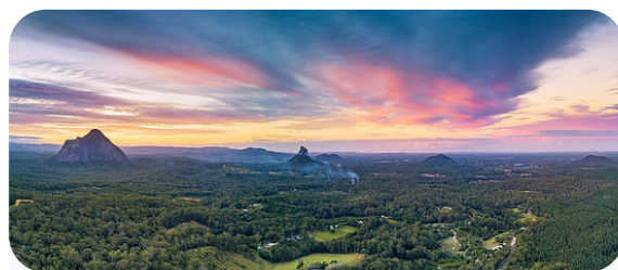
Sunset over the Glass House Mountains from our viewing point

After an illuminating presentation, explore the heavens using state-of-the-art telescopes. Our astronomers will answer your questions and guide your viewing. Enjoy warming hot drinks as we traverse the stars, capturing breathtaking details.