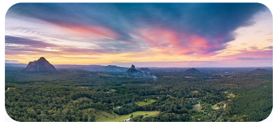
Sunset over the Glass House Mountains from our breathtaking viewing point

After an illuminating presentation, explore the cosmos using state-of-the-art telescopes. Our astronomers will answer your questions and guide you in discovering fascinating phenomena. Enjoy hot drinks to stay warm under the clear mountain air as we traverse the stars and capture stunning details.