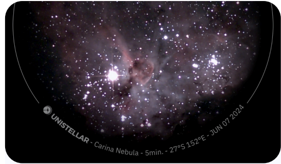
The Carina Nebula, photographed on our inaugural Night Sky Journey in June

Connect with the expansive skies of the Sunshine Coast Hinterland's proposed Dark Sky Reserve on this exclusive evening tour. Join the bus at your preferred location and journey into the cosmos! Beginning with a sunset experience overlooking the Glass House Mountains, we will then visit the historic Maleny Hotel to enjoy their fine fare while the sky darkens fully outside. Then it is time to meet our expert astronomers beneath the stars for our small-group guided viewing.